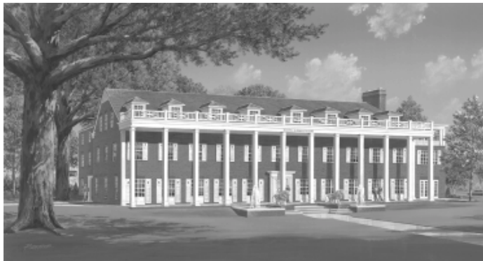
SIGMA ALPHA EPSILON Chapter House Oklahoma State University

You heard it! The Oklahoma Mu Corporation Board announced a major effort to construct a new home for the chapter. The existing 12,000-square foot house is in near irreparable condition and will soon make way for a new 22,000-square foot facility.